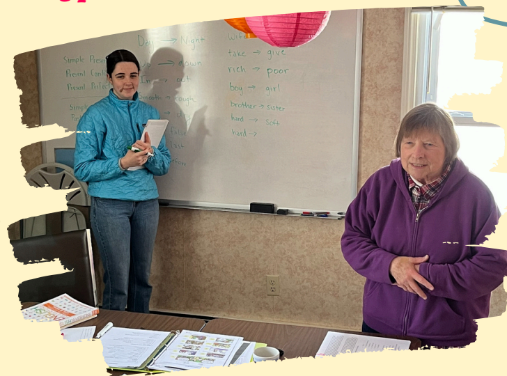
ESOL AT THE ASSUMPTION CENTER

Once a week, I lead the Craft Club at St. Peter Central Catholic School. Meeting and spending time with the kids has been such a blast! They are all so full of creative energy. So far, we have made a list of crafts that have involved painting, scissors skills, color matching, paper flower making, and beading. Our latest big hit was creating friendship bracelets. The kids are so kind to one another, each making one for their friends. I was honored to be given one by a student!