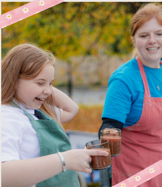
The kids always love smoothies from the smoothie bike!