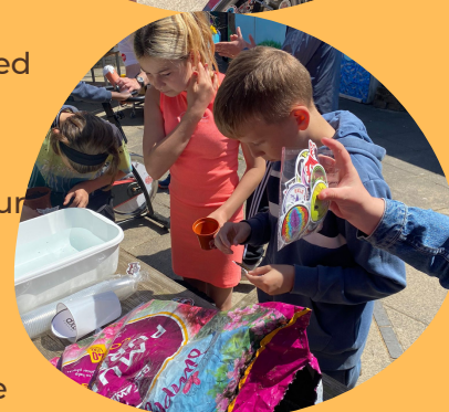
The children participating in environmental activities!

In the moments when I was exhausted from working on filling out environment numbers or when I felt frustrated because I got stuck on something, I would stop and think of a quote I love by St Marie Eugenie, "Love never says I have done enough". That quote alone is such a huge part of the mission here at Kids Kabin. This mission year has given me a hunger for wanting to give more and more. Before this year I thought of myself as a fairly giving person. I thought that I lived simply but through this year's challenges, I have seen what simple living and giving selflessly truly is. Even on the nights I would stay late to work, help others on the team or volunteer for extra things, I never felt as though I was doing enough. I felt satisfied with the work I was doing but I wanted a lasting effect. I wanted something I could leave behind that would continue to help. That is such a huge reason that I worked tirelessly towards achieving our bronze certificate. Even though I could never pay back all that Kids Kabin has done for me and taught me, I hope that it will continue to serve the goal and mission that I've been working so hard towards.