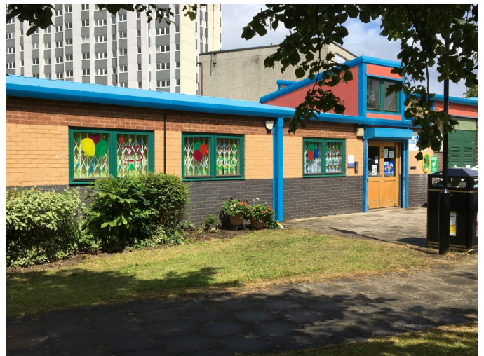
Kids Kabin, Walker neighborhood in Newcastle

Differences have been a key component in forming relationships with the members of Kids Kabin. Differences can cause so much tension around the world, specifically with adults, but with children there is nothing more exciting. Just the way I pronounce “water” differently from them creates excitement. While I feel like I am offering a lot of skills and knowledge to these kids they are so clearly teaching me more than I could ever teach them and I look forward to many more conversations on culture with them. Hopefully, by the time July rolls around I am a fluent Georgie speaker and will make my little (and not so little) teachers proud. Cheers!