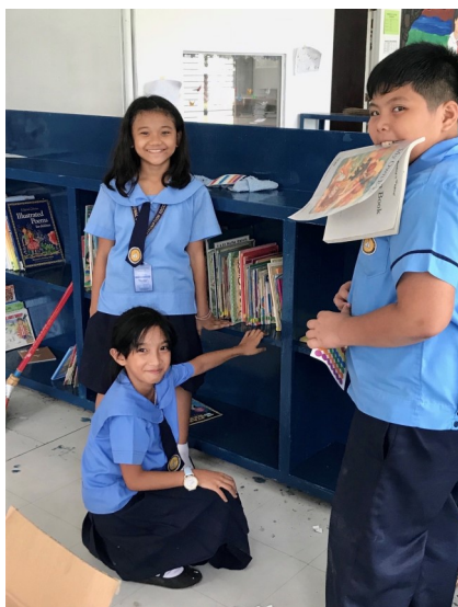
A few students helped with putting the books back on the shelves!