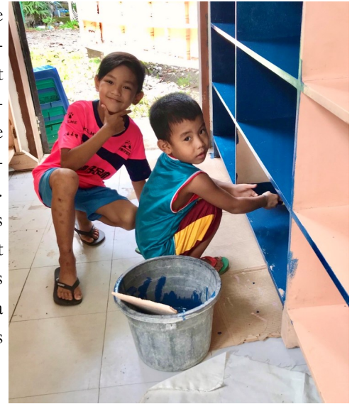
Two of the young students get in on the painting!

Greetings from the other side of the world! As the sun is rising there, it's melting the sea and sky together in hues of lilac out my window. It's just before dark in Barrio Obrero, Iloilo City, the Philippines. This small district juts out from the edge of the city into the sea, and as resilient as its people, weathers storms and waves from three sides. It became populated as a refuge for several waves of victims fleeing fires in the city during the last century. The school at which I live and work is Assumption Socio-Educational Center (ASEC), a Catholic mission elementary school serving this impoverished community.